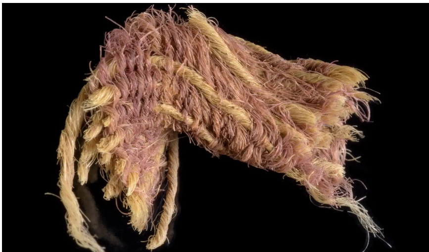
Wool textile fragment decorated by threads dyed with Royal Purple

Archaeologists recovered more than 100 wool and linen fabrics, preserved for over three millennia by the desert climate, dating back to the 11th-10th centuries BC. Previously they had noted that the clothes of some of the ancient metal workers were of an unexpectedly high quality, tightly woven and decorated, mainly in blue and red dye produced from plant-based dyes. Now, using high pressure liquid chromatography, the researchers found three items in the collection that contained signature compounds of royal purple.