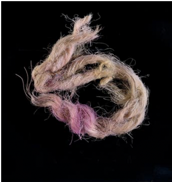
Closeup of a fiber dyed with purple, Timna

Ben-Yosef says that, despite the fact that we have not found significant remains of permanent settlements in the Negev from this period, evidence of the good food and elegant clothes found at Timna are signs of cultural sophistication. Added to the massive size and the standardization of mining activities there and at similar sites (such as Feynan in nearby Jordan), there is indication the hand of a strong, centralized kingdom.